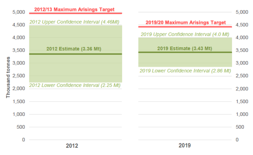
Figure 4: Generation of construction and Demolition waste in Wales 2019 compared to the TZW target

Source: 2019 Wales Construction & Demolition Waste Arisings Survey, NRW 2022